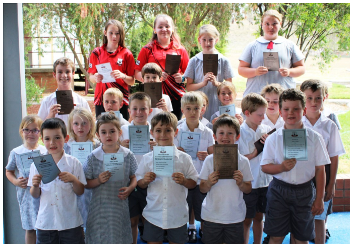
1/2 - Class of the week

Congratulations to all the Assembly Award recipients for week 6.